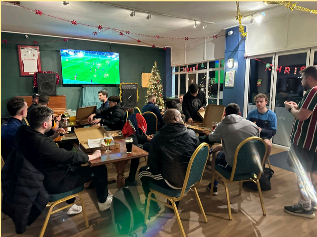
A succesful christmas social down at the clubhouse

https://oldwimbledonians.co.uk/team-colours/